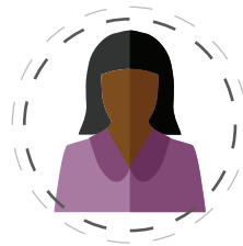
Generation X "Gen X" 1961 - 1980