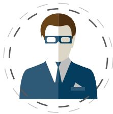
Generation B "Boomers" 1945 - 1960