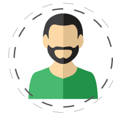
Generation Y "Millennials" or "Gen Y" 1981 - 1995